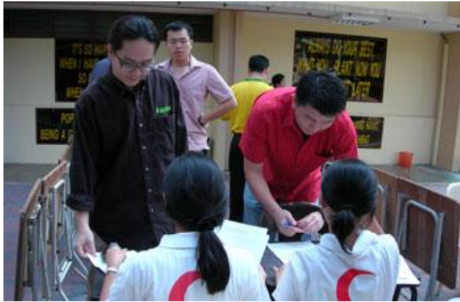
The Fanatics submit their form.